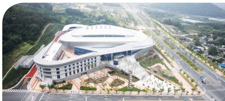
<Half Marathon Course and map>

The half marathon course is a flat loop course which starts at the Athletics Promotion Center, along the road around Daegu Stadium, and goes past the recently opened baseball stadium (Daegu Samsung Lions Park), Athletics Promotion Center and the Daegu Art Museum. It is an eco-friendly course that features beautiful mountains, lakes, clean air and cool breezes for runners to enjoy.