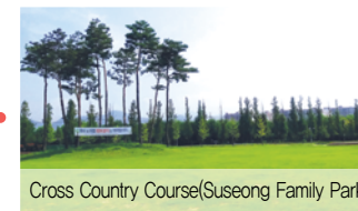
Cross Country Course(Suseong Family Park)