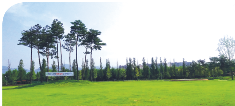
<Cross Country Course and map>

8km Cross Country will take place in 4 laps loop course of 2km in Suseong Family Park. The Suseong Family Park is an eco-friendly and family-friendly resting place with numerous sports facilities and recreation facilities including park golf course and a pool. The Suseong Family Park is 10-minute drive away from Athletics Promotion Center, the main stadium.