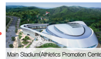
Main Stadium(Athletics Promotion Center)

Line 1 Line 2 Line 3 Shuttle Bus Food Town