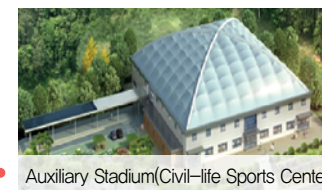
Auxiliary Stadium(Civil-life Sports Center)