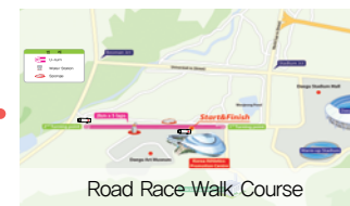
Road Race Walk Course