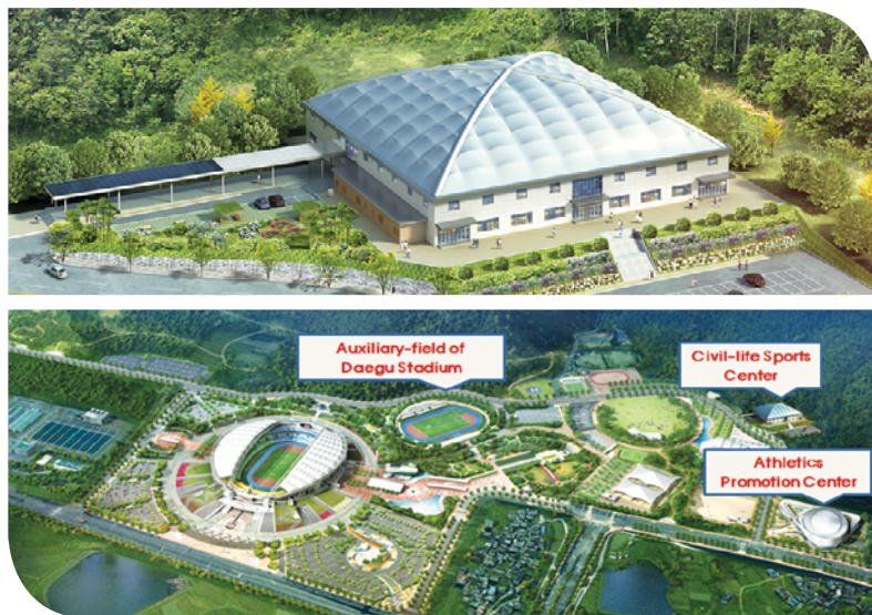
<Auxiliary Stadium and map>