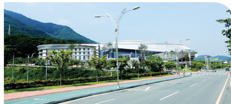
<Race Walk Course and map>

The 10km race walking is an event in which athletes compete on a section of the half marathon course. The race walking starts at the Athletics Promotion Center and loops around the Daegu Art Museum at the foot of Uksu Mountain. Runners must complete this 2km section, five times. The road conditions for the event are optimum for race walking.