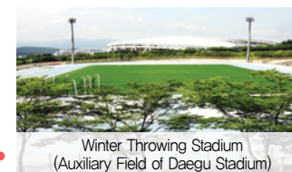
Winter Throwing Stadium (Auxiliary Field of Daegu Stadium)