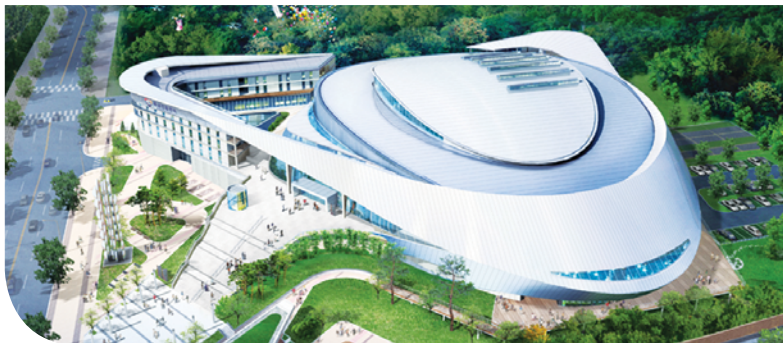
< Athletics Promotion Center >

As the main venue for the World Masters Athletics Championships Indoor Daegu 2017, the Athletics Promotion Center will host numerous track and field events.