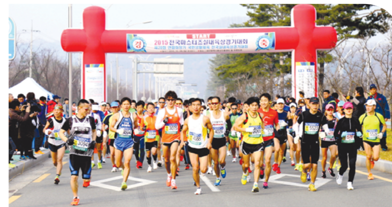
<Daegu National Masters Athletics Championships Indoor 2015>