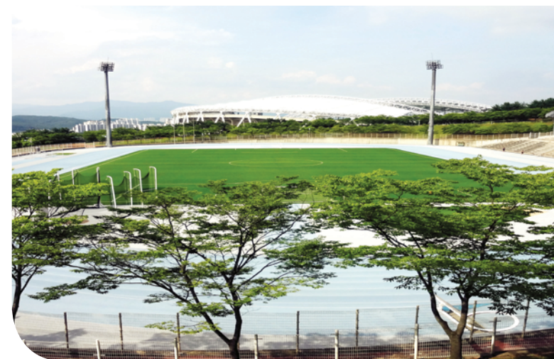
<Winter Throwing Stadium>